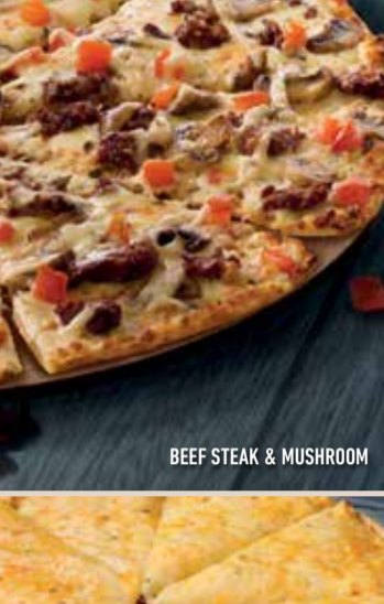
BEEF STEAK & MUSHROOM

HALF & HALF Go HALF & HALF in your choice of 2 PIZZA FLAVOURS!