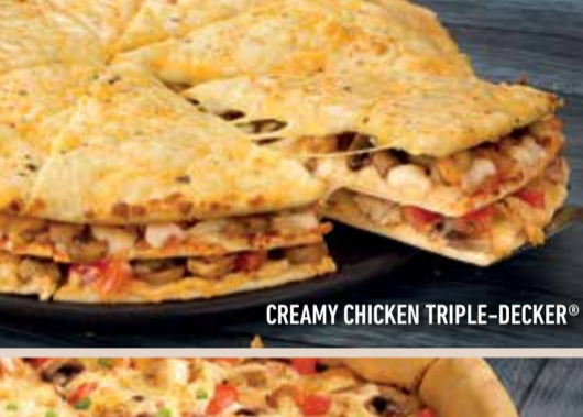
CREAMY CHICKEN TRIPLE-DECKER®